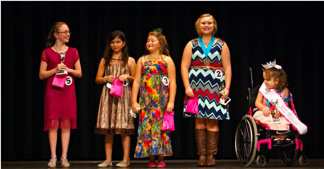
Little Miss Heritage participants in 2015

Welcome to the Jones County Heritage Pageant. This pageant is held during the Jones County Heritage Festival in Trenton, NC. The purpose of this pageant is to allow young women in North Carolina an opportunity to show their talent, make new friends through the spirit of competition, and most importantly - to have fun! We look forward to the youth participating in an activity during the festival and look forward to their contribution to heritage this year and the years after!