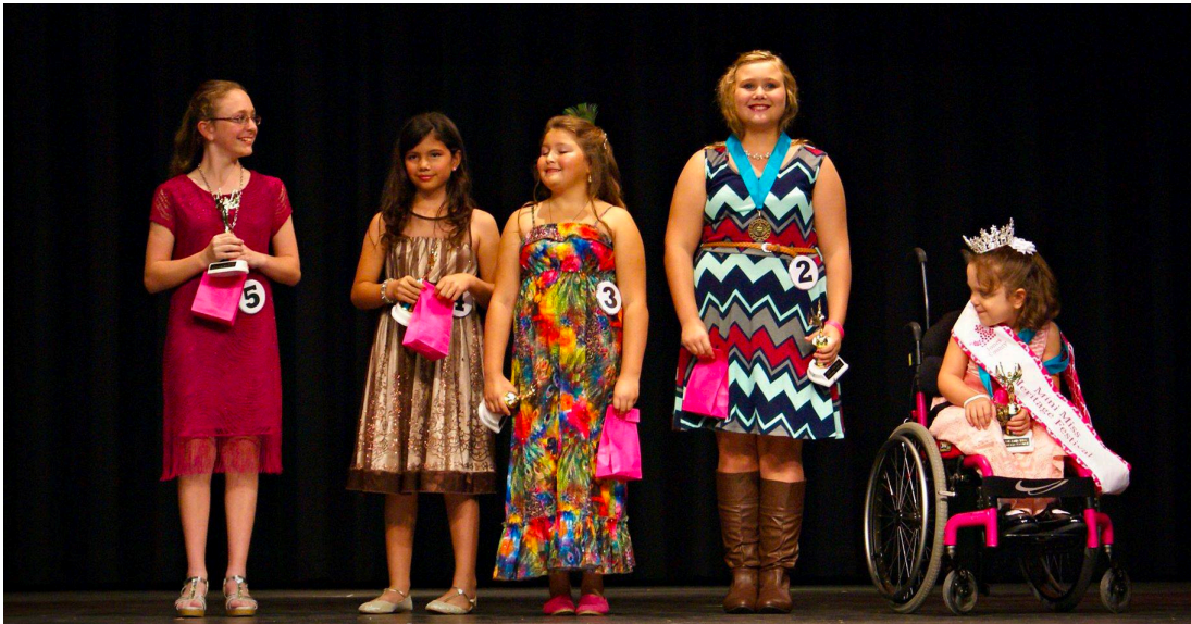
Little Miss Heritage participants in 2015

Welcome to the Jones County Heritage Pageant. This pageant is held during the Jones County Heritage Festival in Trenton, NC. The purpose of this pageant is to allow young women in North Carolina an opportunity to show their talent, make new friends through the spirit of competition, and most importantly - to have fun! We look forward to the youth participating in an activity during the festival and look forward to their contribution to heritage this year and the years after!